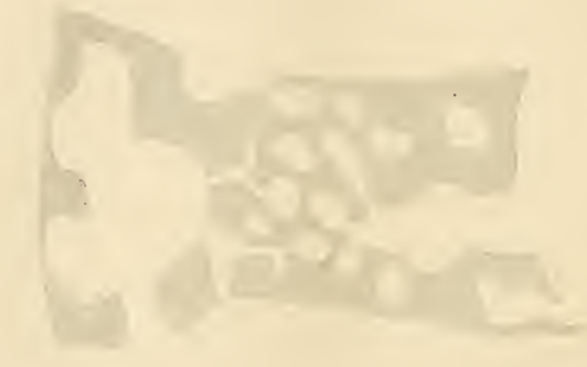
Fig. 2. Radial portion of a transverse section of Stylotella; the flesh of the sponge is tinted, the cavities are untinted; on the extreme left is the dermal membrane pierced by two ostia that lead into a large subdermal cavity, from which incurrent canals lead to the flagellated chambers, which in turn open by an excurrent canal into the gastral cavity at the extreme right. \times 25.

chimney-like projection. When contracted they are completely closed and the delicate tissue about them is puckered into a slight spine-like elevation, the point of which represents the real position of the osculum. The largest oscula when fully open measure, as already stated, about four and a half millimeters in diameter. From each osculum a branched gastral cavity extends through the substance of the sponge either down the length of a finger or into the massive body, depending upon the position of the osculum. In the fingered forms the gastral cavities lie either near the axis of the fingers, and are thus buried in the substance of the sponge, or on the surface of the finger, in which case they can be