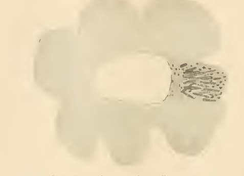
Fig. 3. Transverse section of the base of an oscular collar of Stylotella. The central cavity is the osculum, which, as is shown on the right is directly surrounded by a sphincter of myocytes, external to which is the tissue containing the spicules. \times 35.

In the region of the osculum the myocytes are especially numerous and form a conspicuous sphincter on the inner face of the oscular collar and internal to the mass of longitudinally arranged spicules which surround this opening. As a result the contraction of the osculum is accomplished without much folding of the surface