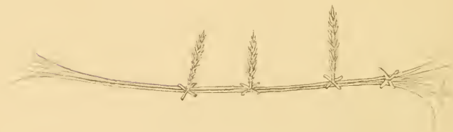
Hyalonema mirabilis Gray (osculum.)