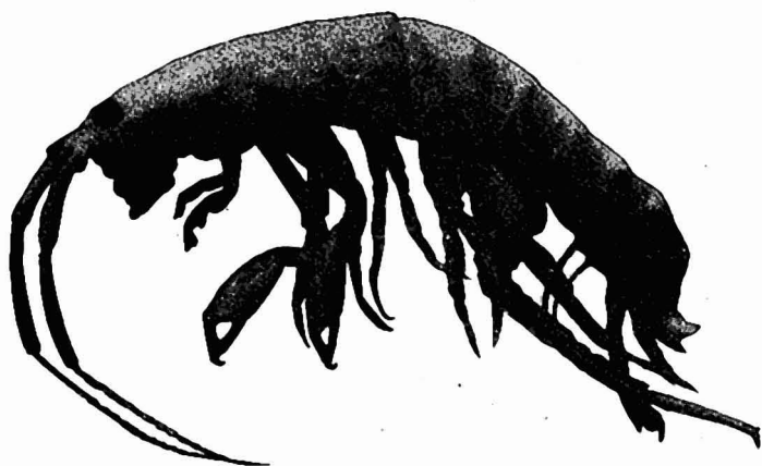
FIG. 1.— ORCHESTIA COSTARICANA , MALE.

The eyes are dark, irregularly rounded, the interval between them less than the diameter of the eye and in large specimens reduced to a very narrow space. The first antennæ do not reach the end of the penultimate joint of the peduncle of the second pair. They have a five-jointed flagellum subequal in length to the peduncle, of which the first and second joints are subequal, broader but not much longer than the third. The second antennæ are slender, with a flagellum of about twenty joints, nearly as long as the peduncle, in which the last joint is considerably longer than the penultimate, more so in the male than in the female. The mouth parts are on the whole all of the character usual in the genus. In the first maxillæ no palp could be detected, but in the female a microscopic notch was seen in the position proper to the base of the palp.