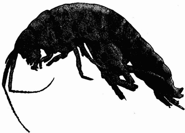
FIG. 2.— ORCHESTIA COSTARICANA , FEMALE.

the fifth apparently quite coalesced with the sixth and consisting of a narrow triangular piece lying alongside the oblong fourth joint. The sixth joint proper has an oblong trunk about twice as long as broad, with the hind margin distally produced into a slender nearly straight thumb about two-thirds the length of the trunk. The finger, somewhat stronger than the thumb, when closed overlaps the pointed apex of the thumb with its own curved and blunt apex, and brings its bulging middle part into contact with the spinulose distal half of the thumb, leaving an irregularly oval gap between the proximal confronting edges of this true chela. It will be noticed in the enlarged figures of the second gnathopod of Orchestia darwinii that the proportions and outline of the trunk are quite different from those of the present species, and also that the finger in closing upon the thumb there presents an arrangement which is scarcely more than subchelate. The second gnathopod of the female is not exceptional. The fourth