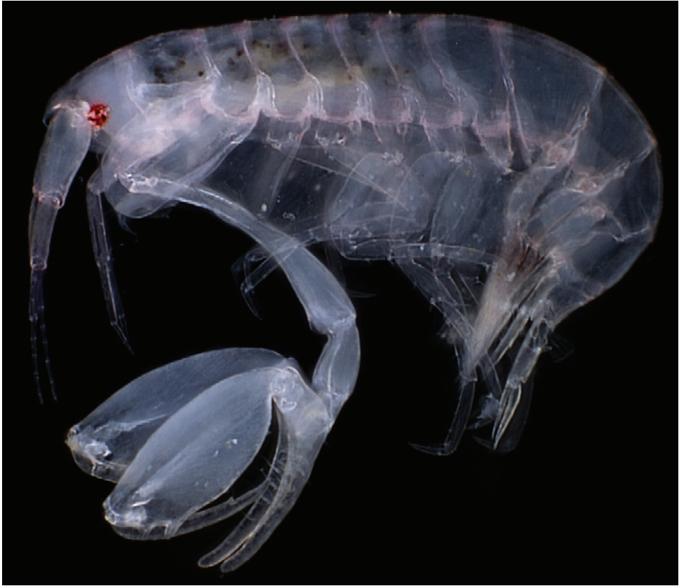
Figure 3. AutoMontage Z-stacked photograph of A. bananarama sp. n., holotype, anamorph male male "A", 2.34 mm.

2, flagellum short, 5-articulate. Gnathopod 1, coxa moderately reduced, extending to ventral margin of head, apically bifid; carpus shorter than propodus, with two apical recurved spines, anterior margin bare; propodus, posterior margin finely serrate, bearing a thick recurved apical seta. Gnathopod 2, anterior margin of coxa broadly rounded, ventral margin slightly produced, posteroventral corner with small cusp, posterior margin straight; propodus, palm angle transverse, palmar margin defined by series of concavities and processes, corner of palm defined by distinct cusp; dactyl reaching to end of palm. Telson 1.72 times longer than wide, with 2 apical setae.